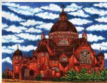
Dortmund. A synagogue built in 1900 and destroyed as a test to gauge public opinion in September 1938.

in an exquisite assemblage of paintings and words in her book, Where We Once Gathered, Lost Synagogues of Europe . Free.