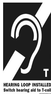
HEARING LOOP INSTALLED Switch hearing aid to T-coil

Our sanctuary is equipped with a hearing induction loop. If you have a hearing aid or cochlear implant equipped with a t-coil, please flip the switch which engages the t-coil. The sound from the microphones will be transmitted directly to your hearing device.