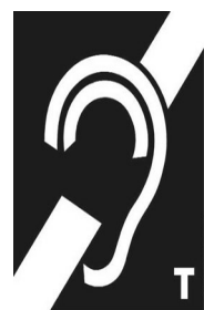
HEARING LOOP INSTALLED Switch hearing aid to T-coil

Our sanctuary is equipped with a hearing induction loop. If you have a hearing aid or cochlear implant equipped with a t-coil, please flip the switch which engages the t-coil. The sound from the microphones will be transmitted directly to your hearing device.