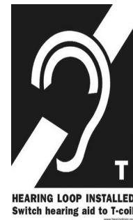
HEARING LOOP INSTALLED Switch hearing aid to T-coil

Our sanctuary is equipped with a hearing induction loop. If you have a hearing aid or cochlear implant equipped with a t-coil, please flip the switch which engages the t-coil. The sound from the microphones will be transmitted directly to your hearing device.