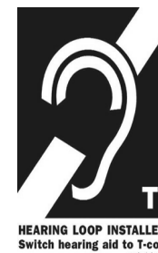
HEARING LOOP INSTALLED Switch hearing aid to T-coil

Our sanctuary is equipped with a hearing induction loop. If you have a hearing aid or cochlear implant equipped with a t-coil, please flip the switch which engages the t-coil. The sound from the microphones will be transmitted directly to your hearing device.