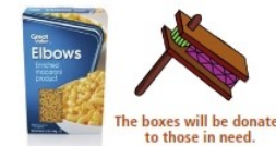
The boxes will be donated to those in need.