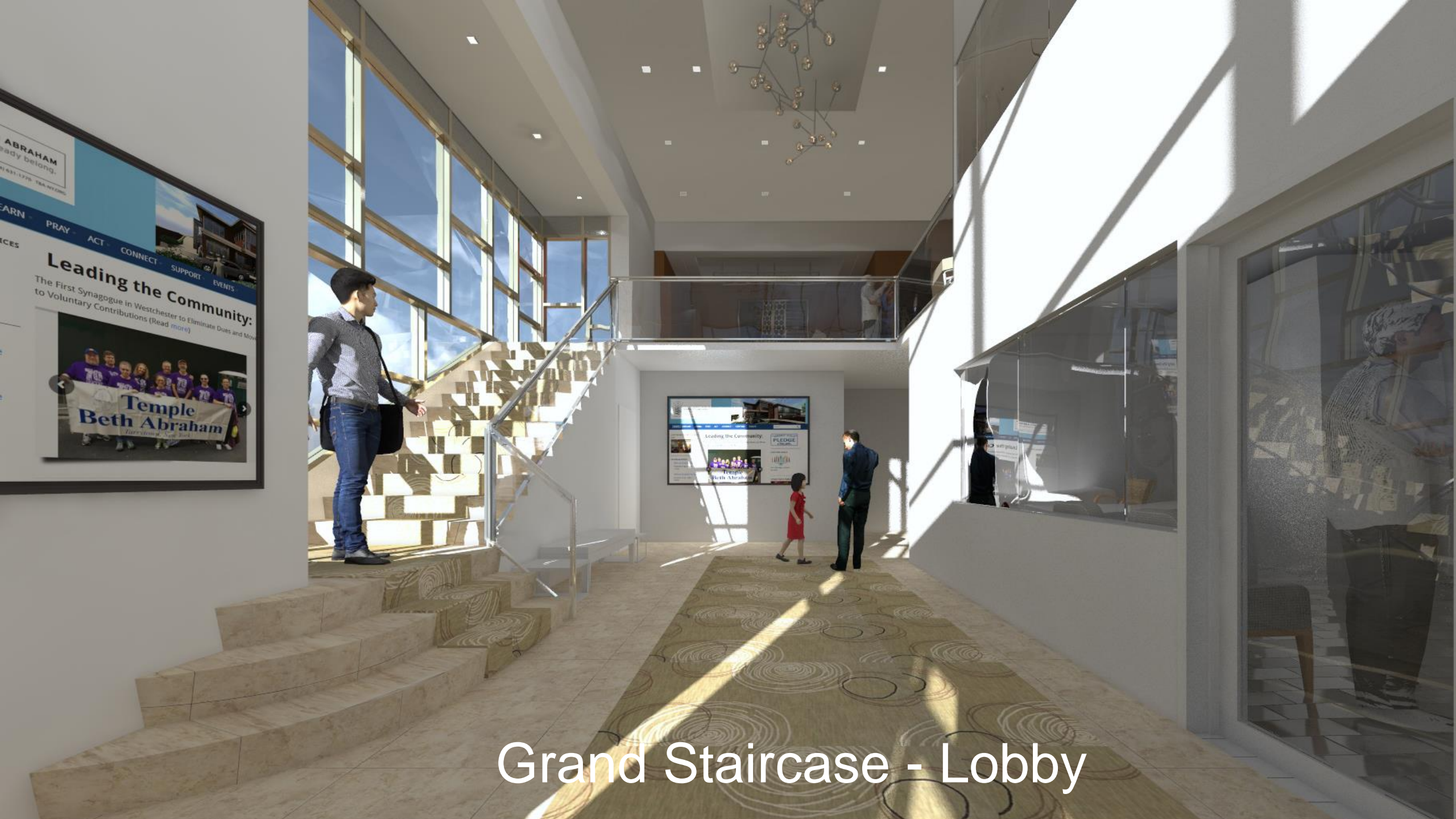
Grand Staircase - Lobby