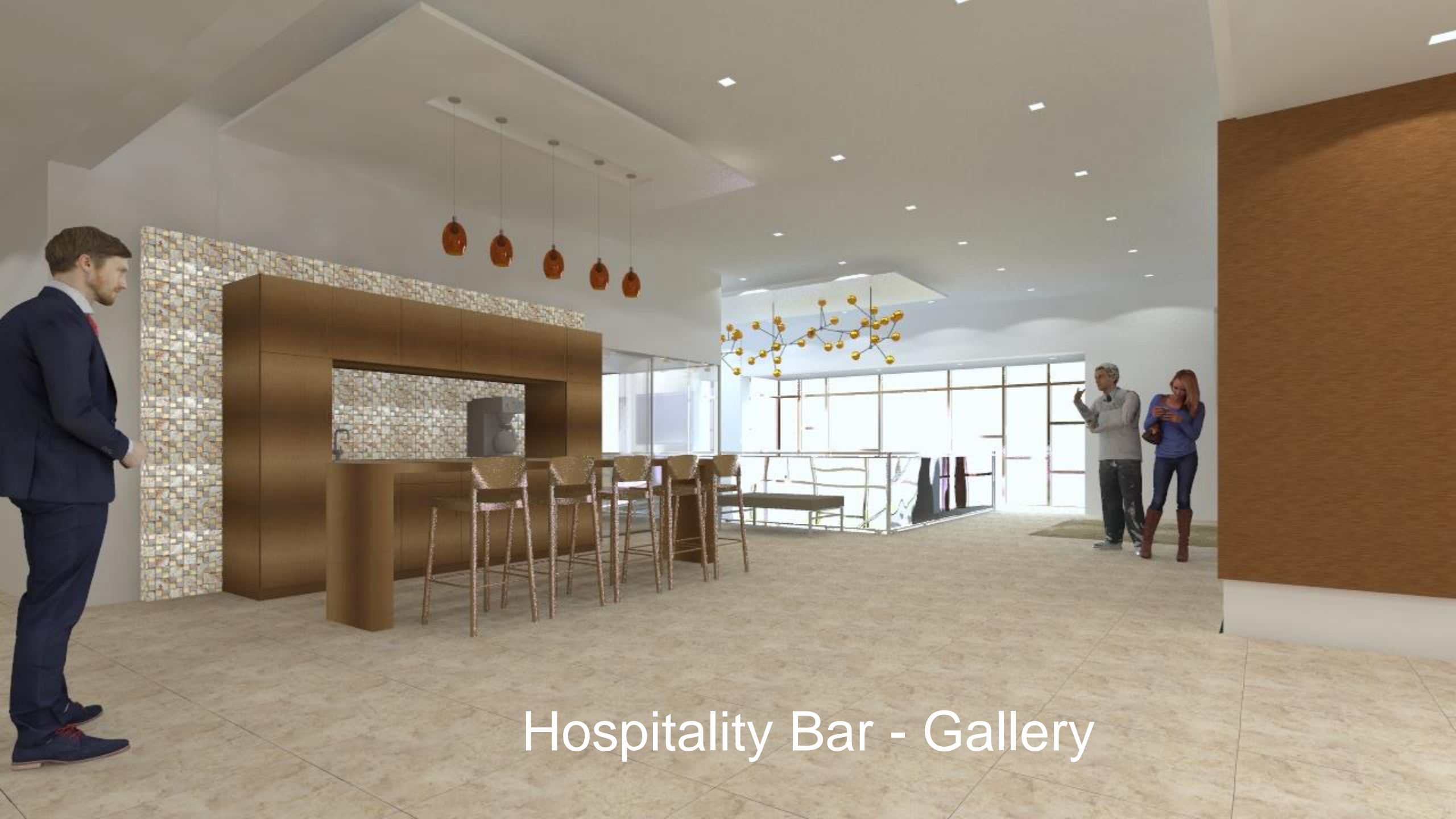
Hospitality Bar - Gallery